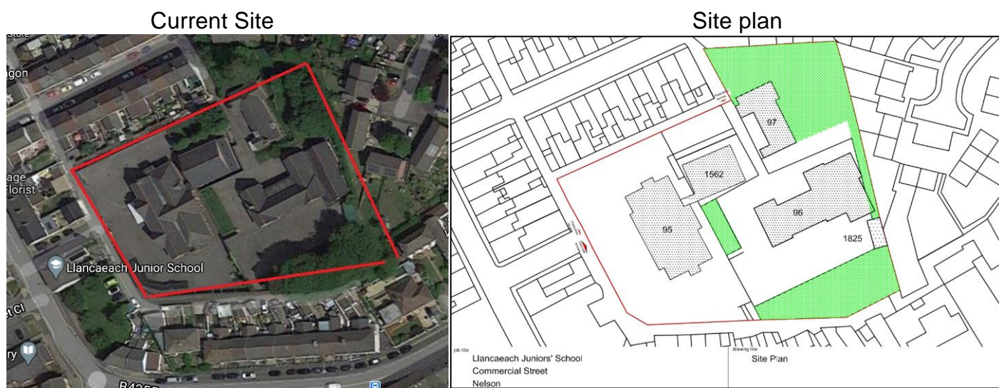
Table 4: Llancaeach Junior School Site Information

The site of Llancaeach Junior school opened in 1909 and occupies a total area of approximately 0.67 Hectares which accommodates 4 structures and limited outdoor play areas. The school building has a gross internal area of 1479 square metres and has a condition rating of C+ under the Faithful and Gould methodology.