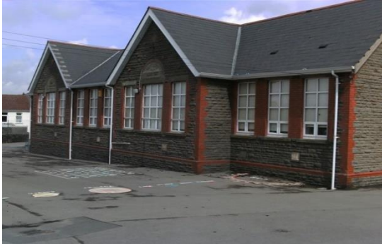
Llancaeach Junior School

Llancaeach Junior School (Key Stage 2 : 7-11 years) and Llanfabon Infants School (Foundation Phase & Key Stage 1 : 3-7 years) are currently operating over two separate sites within 0.5 miles distance of each other within the Caerphilly West, Nelson area.