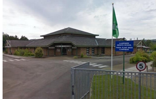
Llanfabon Infants School

Every school must provide a curriculum which is broad and balanced in content and relevant to all learners' needs. The child's learning journey should be seamless throughout their time in school, building on experiences, skills, knowledge and understanding as they progress. There is a clear link between new and improved school buildings and improved performance as highlighted by ESTYN.